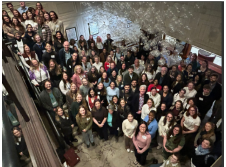
Attendees at the 10th EMCRF in Glasgow