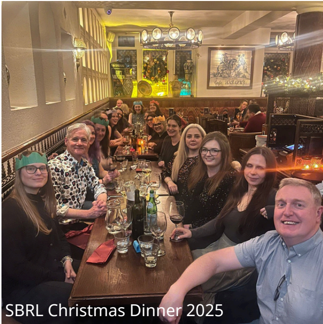
SBRL Christmas Dinner 2025